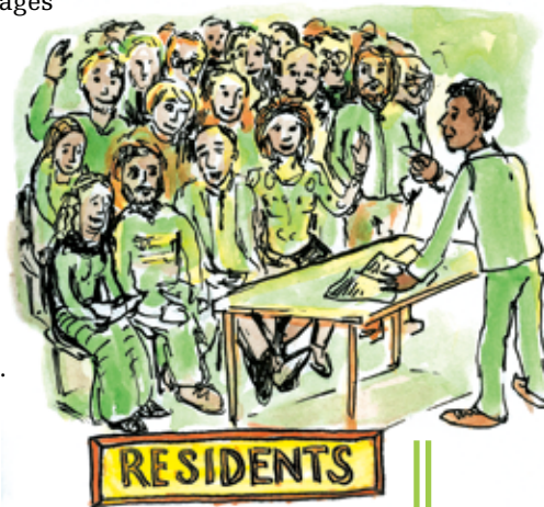
You are invited to a residents' meeting once a year. The trustees and resident committee are chosen at the meeting.

If you forget or lose your home keys, you can find contact information for help on the front door or notice board.